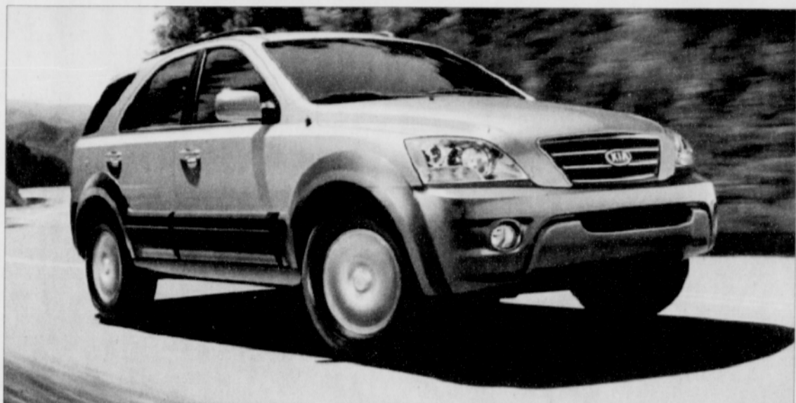
Specifications: 3.8-liter 24-valve DOHC, V6 engine; 5-speed automatic transmission, 4-wheel drive w/Low Range; 17-city mpg, 22-highway mpg.; $ 29,865 MSRP.

The new five-passenger Kia Sorento features an all-aluminum 3.8-liter V6 engine with 262-horsepower at 6000 rpm, and torque 260 at 4500 ft.-lbs. That is a 36% increase over the SUV's previous 3.5-liter V6. The electronically controlled five-speed transmission allows drivers to switch between automatic and manual. The new powertrain helps