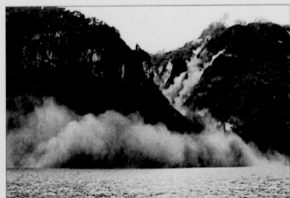
A tremor rocks southern Chile's Aysen fjord on Saturday. Authorities say repeated earthquakes in the area may be related to the birth of an under-sea volcano.

President Michelle Bachelet on Sunday visited Puerto Aysen, a city close to the fjord about 1,700 miles south of the Chilean capital of Santiago, where she was met by hundreds of angry residents who claim the government is not paying attention to their needs.