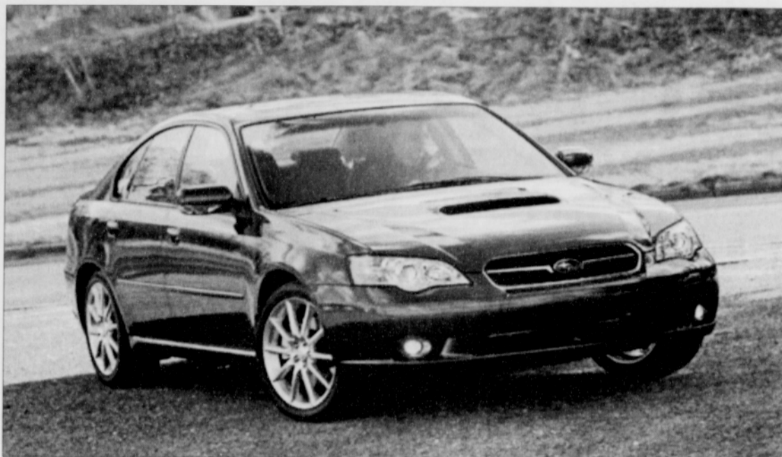
Specifications: 2.5-liter Turbocharged intercooled aluminum alloy twin-cam 16-valve flat 4-cylinder engine; AWD 6-speed manual transmission with SI-Drive; 19-City mpg 26-Highway mpg; $33,995 MSRP.

B delivers a speedy 0-60 mph in 5.1 seconds. The engine incorporates AVCS (Active Valve Control System) which electronically varies the camshaft and timing for optimum efficiency in pursuit of the sweet