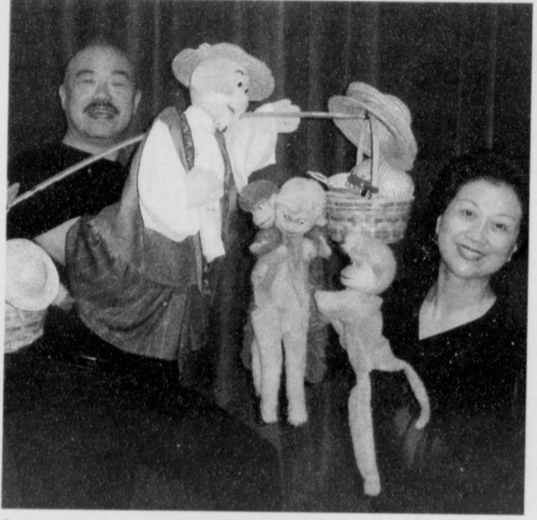
Dragon Arts Studio performers present Images of China using Chinese rod puppetry, an ancient art form.

Music Productions by: DJ 06 One Guest performances by former members of The Northwest Afrikan American Ballet Co. Featuring: Gumboots: South African Boot dance General Admission tickets: $12 For more information call: 503 442-5617 urbanarts@urbanartsdance.com • www.urbanartsdance.com Parkrose High School • 12003 NE Shaver • Portland, OR 97220