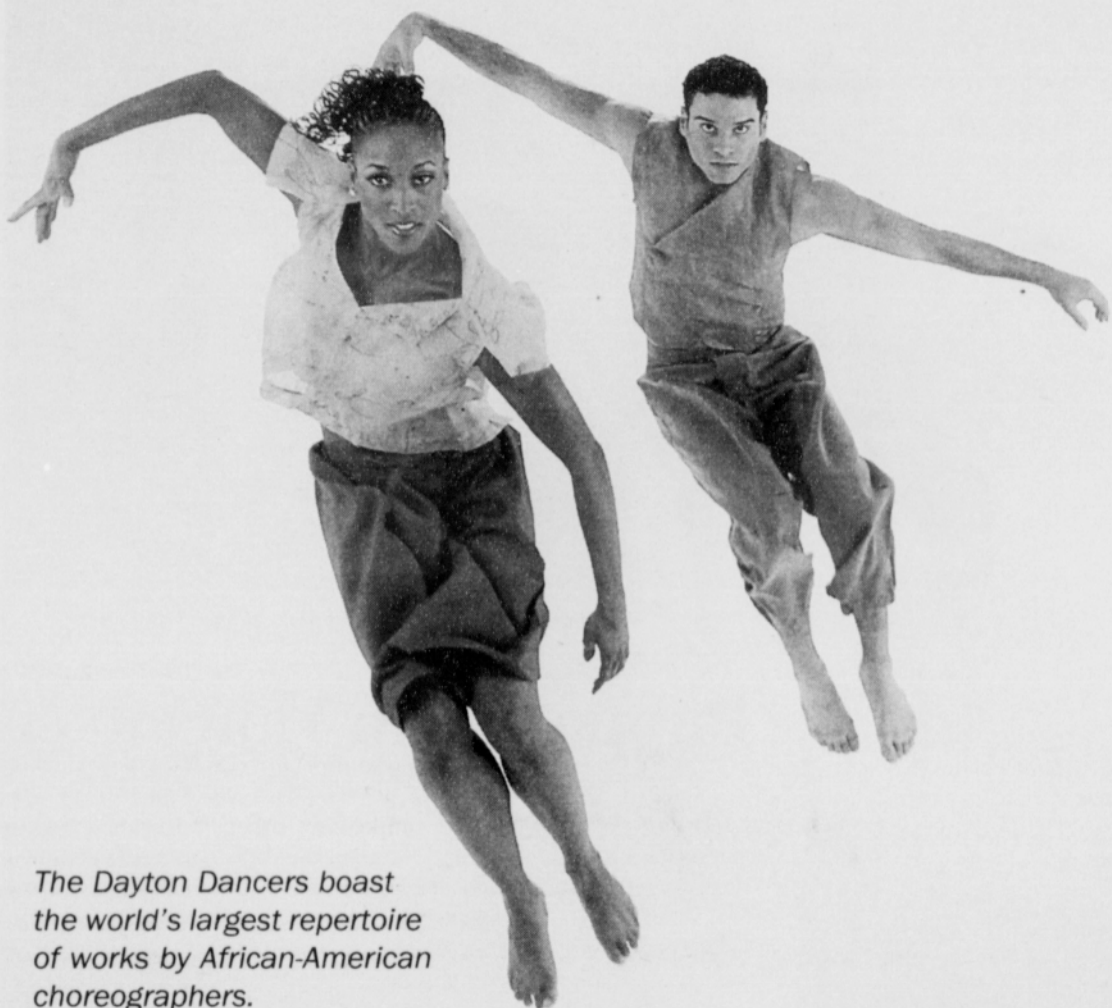
The Dayton Dancers boast the world's largest repertoire of works by African-American choreographers.