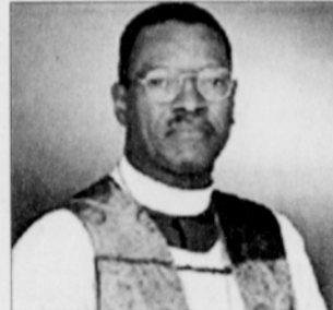
Charles E. Blake

The Church Of God In Christ General Assembly, the largest African-American Pentecostal religious denomination in the world, has appointed Bishop Charles E. Blake to head the assembly as its seventh Presiding Bishop.