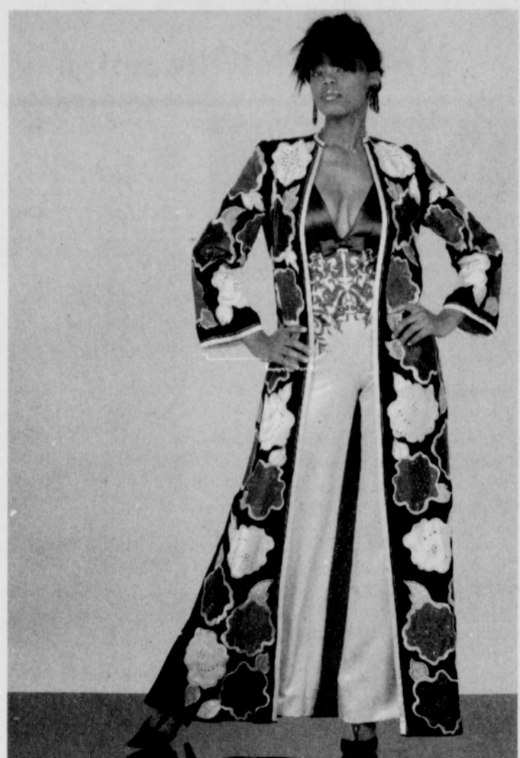
Fashion by Renalto Balestra of Rome brings laser cut scrolls of blue silk satin that ornately appliqué the midriff of a décolleté two-tone empire waist jumpsuit worn under a maxi length black velvet duster coat appliquéd with large floret patches of silk satin.

With the community's continued support, the local Links organization hopes to raise $30,000 for scholarships this year.