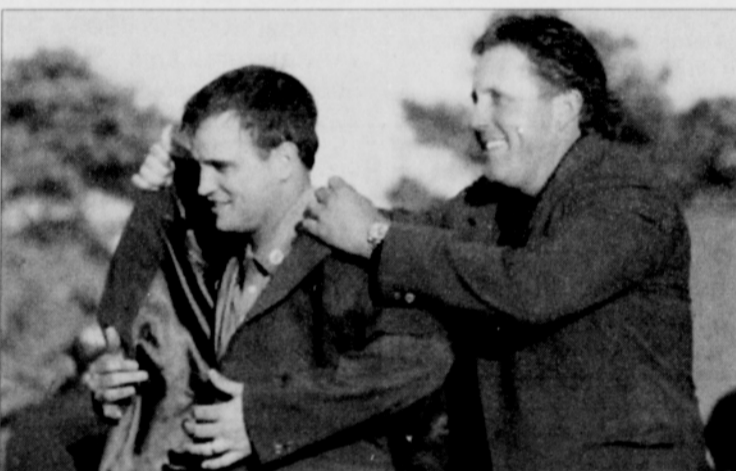
Zach Johnson (left) receives a customary green jacket from 2006 champion Phil Mickelson for winning the Masters Sunday.

A strange week at Augusta National saved the biggest surprise for the very end — Johnson as the Masters champion, and beating Woods to get there.