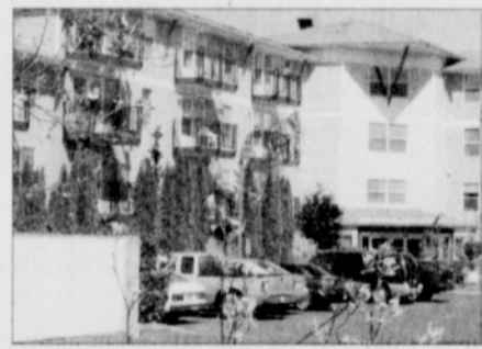
Lents Village in southeast Portland provides affordable senior housing.

At Lents Village, a community kitchen was designed for Loaves and Fishes to