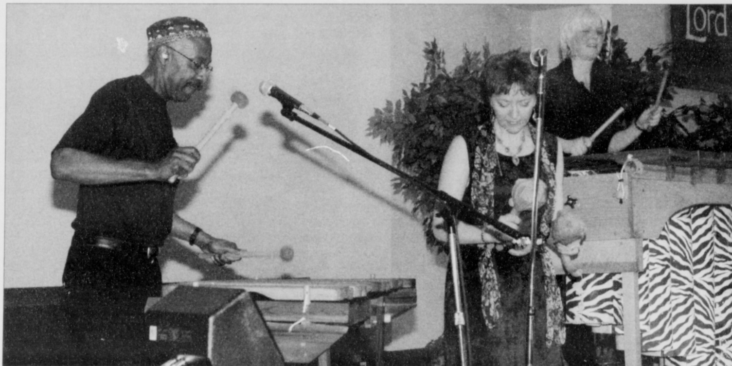
The high-energy music of African marimba is coming to northeast Portland's Evangel Baptist Church.