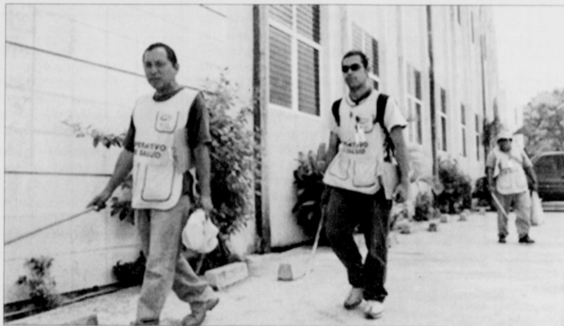
An anti-dengue brigade, belonging to the municipal health department, walk in the street checking for standing water or other areas where mosquitoes breed in the resort city of Cancun, Mexico.

Overall dengue cases have increased by more than 600 percent in Mexico since 2001, and worried officials are sending special teams to tourist resorts to spray pesticides and remove garbage and standing water where mosquitoes breed ahead of the peak Easter Week