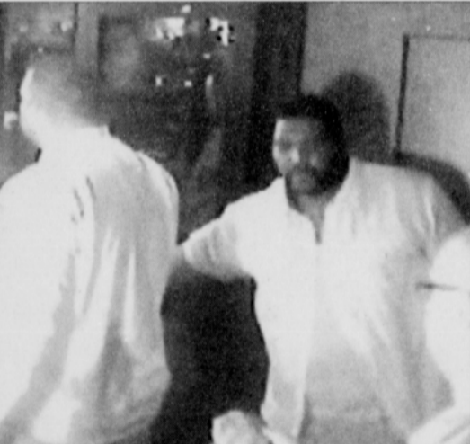
Surveillance video shows a man (center), believed to be 6-feet tall and in his 20s, who is a suspect in a multiple stabbing that occurred this past August at Exotica nightclub on Northeast Columbia Blvd.