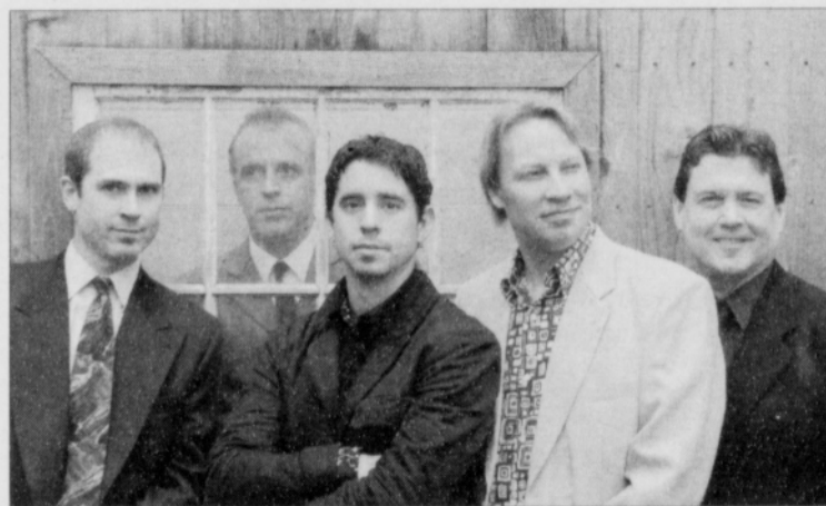
3 Leg Torso

Trippin' through Town - Take a trip through time to find the hottest poetry, hip-hop and soul influencing Portland on Wednesdays at the Ohm. $7 cover. 31 N.W. First Ave