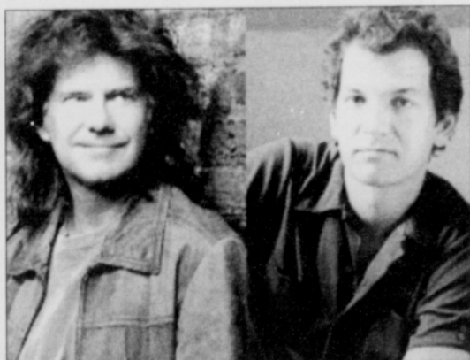
Pat Metheny and Brad Mehldau

Tickets are available at all Safeway/Ticketwest outlets.