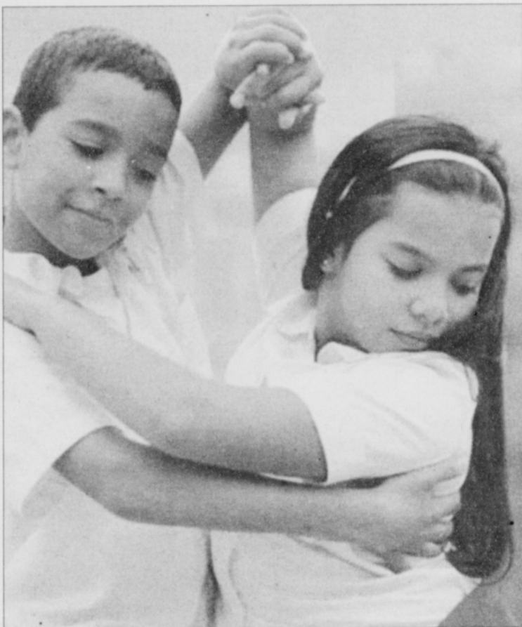
"Mad Hot Ballroom" is a documentary about a group of 11-year-old New Yorkers who take up ballroom dancing.

This two-thumbs-up, touching documentary ties our loyalty to students who may have otherwise hitched their ambitions to wayward stars. We are rooting for the students, and for their parents and their teachers, as we are secretly rooting for ourselves as parents and teachers.