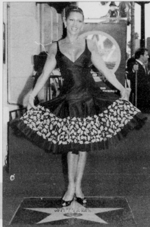
Vanessa Williams gets her star on the Hollywood Walk of Fame.

Williams stepped down as the first black Miss America in 1984 after Penthouse magazine published nude, sexually explicit photographs of her taken several years earlier. In the years since, she has sung on Broadway, released Grammy-nominated albums and acted on screens both big and small.