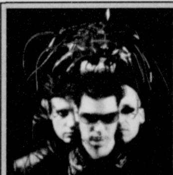
The Portland-based rock group Kandles at Nine.