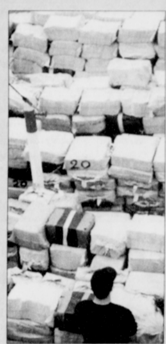
A U.S. Coast Guard keeps watch on 19.4 metric tons of cocaine confiscated from the cargo ship Gatun in Panama City.

Everyone's lives turn upside down when a young woman from Mexico City tries to "liberate" her provincial cousins, in the Spanish language production of "Rosalba Y Los Llaveros" at Milagro Theatre, April 5 - 28.