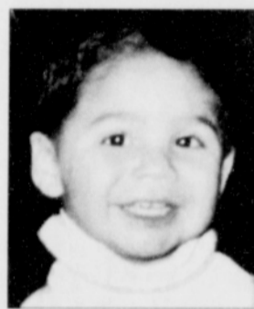
EVERYSTATELY Current Age: 2 years