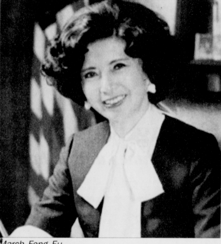
March Fong Eu