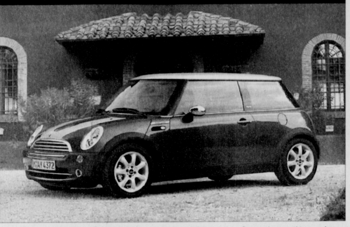
SPECIFICATIONS: 1.6-liter, 16-valve inline 4-cylinder, 118-hp engine; 6-speed manual transmission; 32 MPG-City, 40 MPG-Highway; $ 27,000 MSRP.

tionary on the inside." The interior still has a sporty look to it, though now a bit less extreme, with the enlarged round speedometer in the center of the dash, and the tachometer mounted on and moving with the tilt-adjustable steering column to remind owners of the classic Mini heritage and campy style.