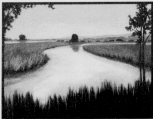
Pictured: Jamee Linton "River Bend" painting