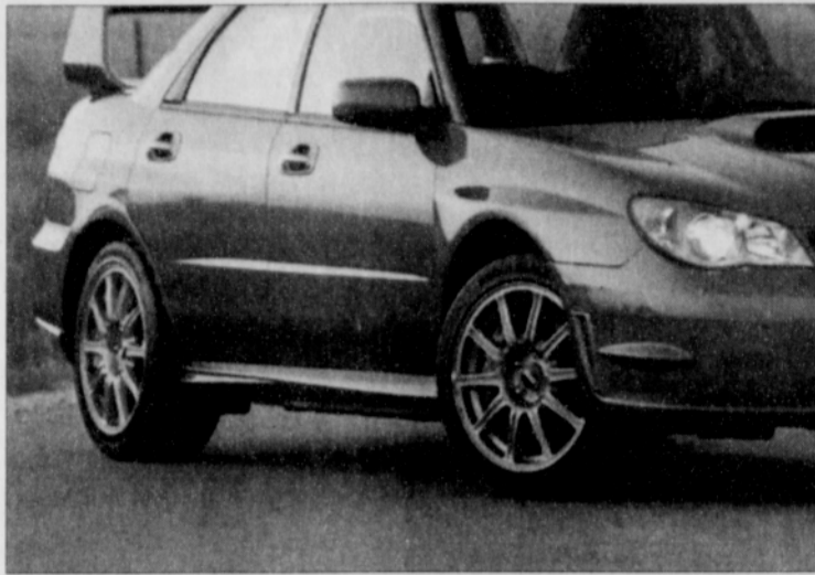
Street Racing 101 Stock Options: 2.5-liter DOHC intercooled turbocharged 4-cylinder engine; 300-hp at 6,000 rpm and 300-lb.ft. at 4,000 rpm; 6-speed manual transmission. 18-City mpg/ 24-Highway mpg; $33,000 MSRP

The 2006 STi appearance and performance enhancements include the tough-looking rear-spoiler and hood scoop, which has been narrowed to feed more air to the intercooler. The STi has the aggressive stance of a speed skater - powerful and poised in the radiant light of the factory-stocked ground effects, body low - leaning into the wind improve to aerodynamics. As you