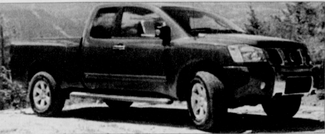
SPECIFICATIONS: 5.6-Liter, 32-Valve Endurance V-8 engine; 5-Speed Automatic transmission w/

simple and direct. The big fender a pleasure. The Titan has brilliant ing up an impressive and enthusicuring cargo and accessories, and flares give the look of a rugged- throttle response. Its power train is astic 0-60 in 7.2 seconds, it isn't a a stash box integrated into the