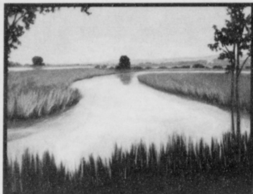
Pictured: Jamee Linton "River Bend" painting