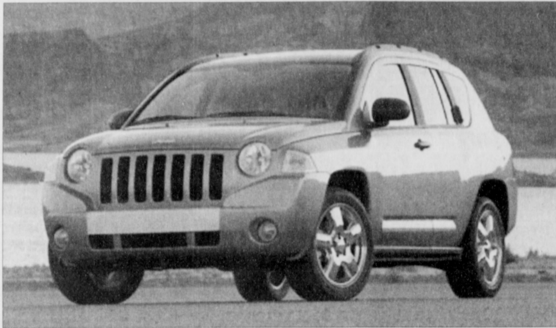
SPECIFICATIONS: 2.4-Liter, 4-Cylinder engine; 5-Speed Manual transmission; City - 26 mpg. / Highway - 30 mpg.; $ 22,100 MSRP.

The Jeep Compass uses Daimler Chrysler's 2.4-liter, four-cylinder World Engine, developed jointly with Mitsubishi and Hyundai. It's a solid, sophisticated, 16-valve engine, quieter and stronger than a four-banger was believed capable of being, 10 years ago. Emphasis during development of this engine was on fuel mileage; even carrying 3326 pounds, the Compass 4WD with a 5-speed manual transmission delivers 26 city and 30 high-