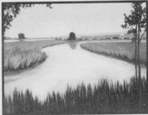
Pictured: Jamee Linton "River Bend" painting