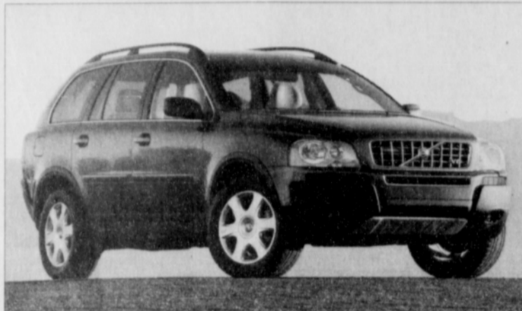
DESCRIPTION: 3.2-Liter, Inline 6-Cylinder engine; Geartronic 6-speed electronically controlled automatic/manual transmission w/Lockup Torque Converter; CITY is 16-MPG and HIGHWAY is 22-MPG; $45,200.00 MSRP.

the Volvo XC90 also provides plenty in the way of practicality. Headroom and legroom are ample for children and teenagers in the second and third rows, and both the 40/20/40-split second-row seat and the 50/50-split third row can fold flat into the floor when extra cargo space is needed. There's even an integrated child-