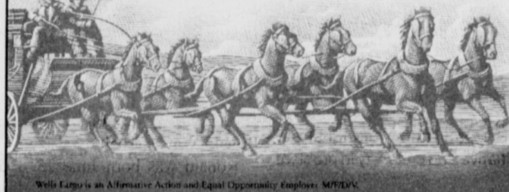
Wells Fargo is an Affirmative Action and Equal Opportunity Employer. M/F/V/D/V