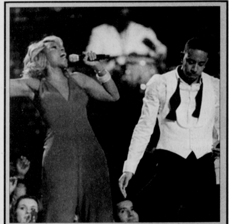
Big Night at the Grammys Ludacris and Mary J. Blige perform the song 'Runaway Love' at the 49th Annual Grammy Awards on Sunday in Los Angeles. It was a big night for women, with Blige, the Dixie Chicks and Carrie Underwood winning some of the most prestigious awards.