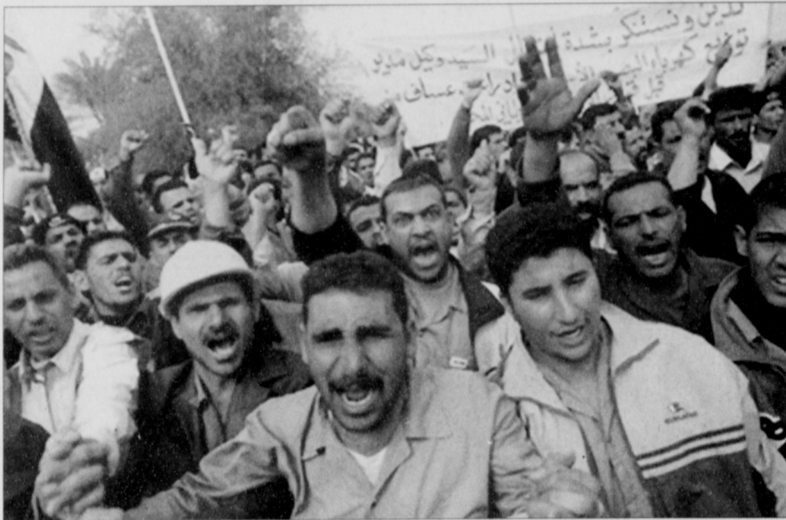
Iraqis chant slogans while protesting Tuesday after British troops arrested a government power distribution engineer in Basra in southern Iraq.

Republicans, now the minority party on the Hill for the time in 12 years, issued impassioned warnings of the consequences of undermining the president's policies in Iraq. "We will embolden terrorists in every corner in the world. We will give Iran free access to the Middle East," said Republican leader John