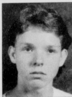
Missing at age 16