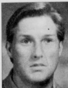
What he may look like today