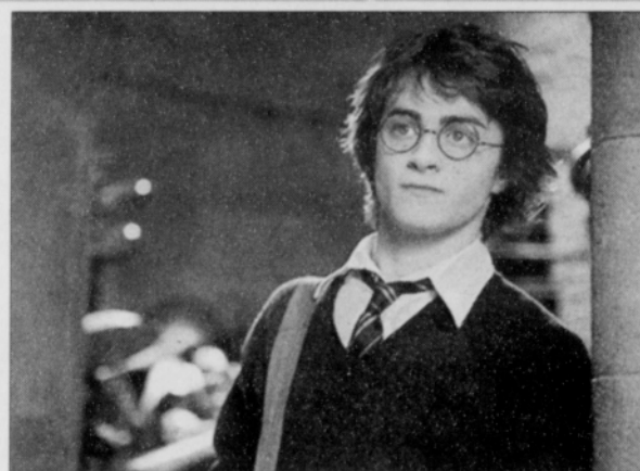
Harry Potter star Daniel Radcliff on the set of "Harry Potter and the Goblet of Fire."

British book retailer Waterstone's predicted that half a million copies would fly off the shelves on day one of sales.