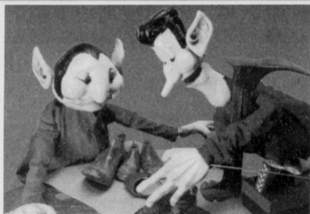
Tears of Joy Puppet Theatre brings 'Shoemaker and the Elves' to the Portland Center for the Performing Arts, Friday Feb. 2 through Feb. 18.