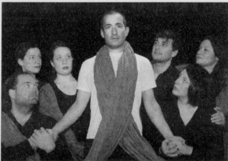
The Yellow Boat

The Golden Fish -- The Brooklyn Bay, 1825 S.E. Franklin, Bay K., presents the tale of the poor Rus-