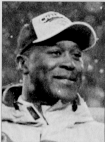
Bears Coach Lovie Smith

Their relationship dates to 1996, when Dungy hired Smith to coach linebackers for the Tampa Bay Buccaneers. They were a page-one story throughout Super Bowl week, discussing daily the laid-back personalities and Christian faith they