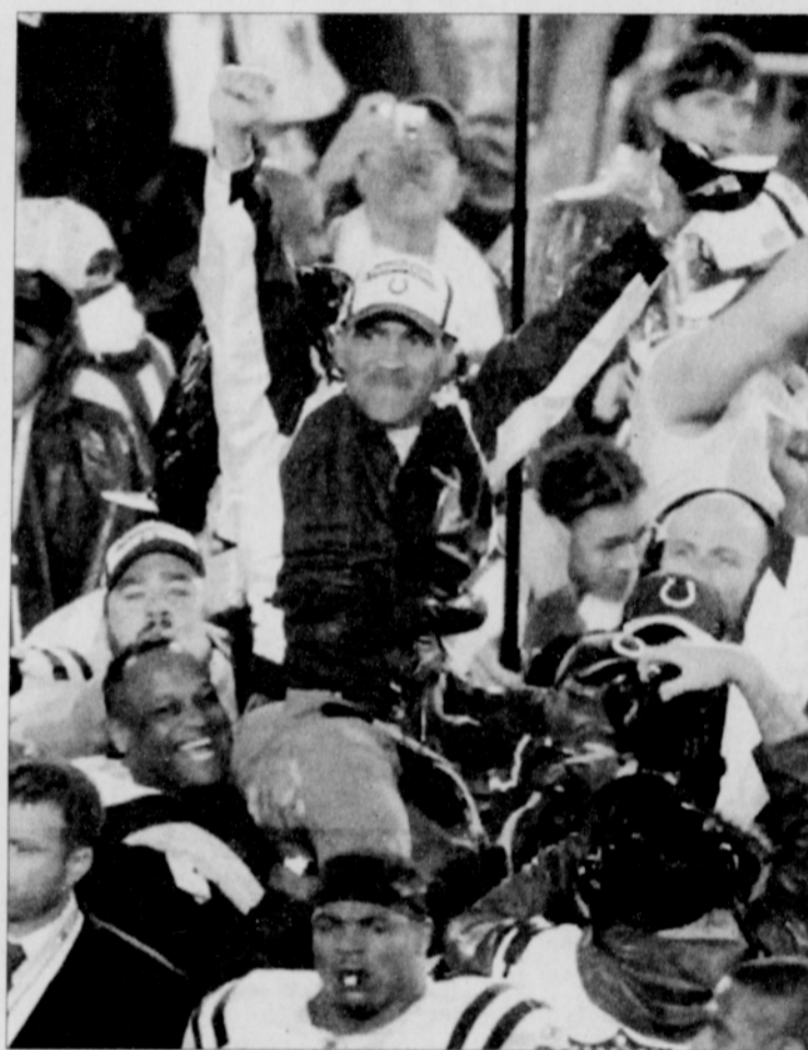
Indianapolis Colts coach Tony Dungy rides aloft his players' shoulders after winning Super Bowl XLI on Sunday.