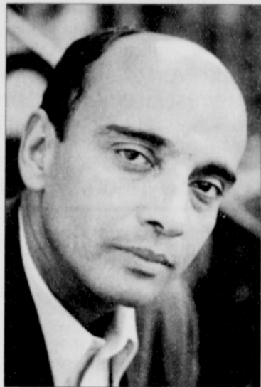
Kwame Anthony Appiah

Time magazine named Rebecca Walker one of the 50 most influential future leaders of America when she was only 25. Her published memoir, "Black, White, and Jewish: Autobiography of a Shifting