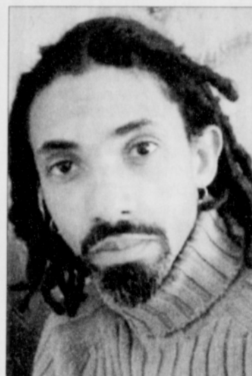
Robin D.G. Kelley

Self" was an international bestseller. She also wrote "To Be Real: Telling the Truth and Changing the Face of Feminism."