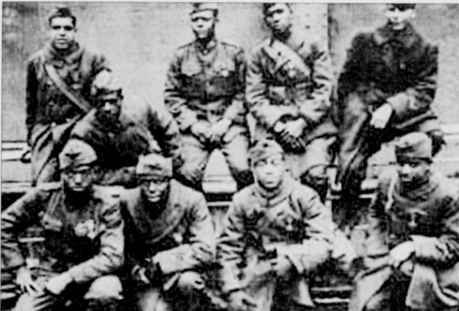
Members of the African American World War II combat regiment known as the "Harlem Hellfighters."

Although relegated to non-combat duty by the U.S. Command, the 369th was sent to France and spent more time in front-line trenches than any other American infantry unit. Fighting alongside French, Moroccan, and Senegalese soldiers, these men distinguished themselves in some of the fiercest battles of the war.