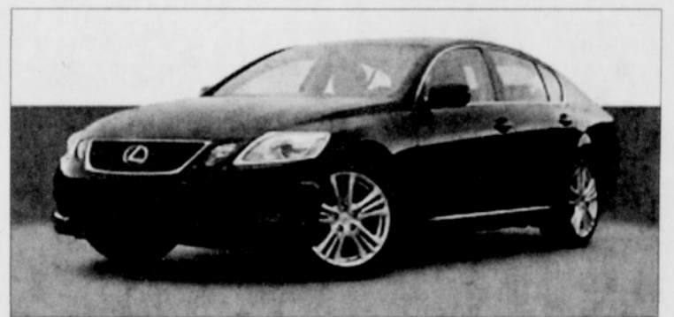
World's First Hot-Rod Hybrid

When it comes to comparisons with others in its class, Versa is a car packed with the unexpected. Both the Sedan and Hatchback start with a 122-hp engine that delivers class-leading power and torque, plus exceptional fuel-efficiency. Available high-tech features like the Intelligent Key keyless entry system, Bluetooth Hands-Free Phone System, and advanced Xtronic CVT (Continuously Variable Transmission) will surprise. So will the largest interior in its class. These are things you wouldn't expect, but will quickly appreciate. Explore the brand-new Versa.