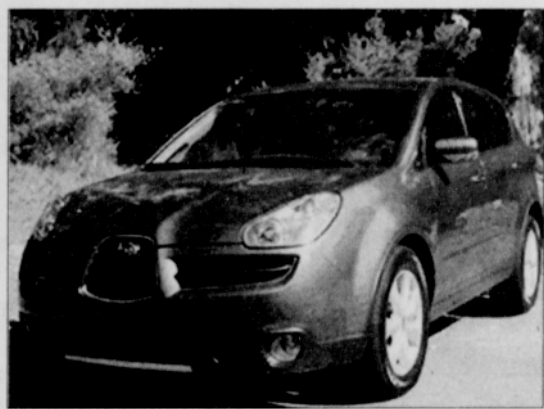
Safety and Comfort

The Edge is a comfortable, quick, smooth-riding midsize SUV, with 5 seats and fresh styling. The Edge is Ford's first entry in the burgeoning crossover utility vehicle (CUV) market, an area that has assumed more importance lately because of the volatile gas prices. The big news is that the Edge is one of the first recipients of the new corporate 3.5-liter V-6 engine shows good power, sprinting to 60 mph in roughly 7.5 seconds. This new engine design has the potential for capacity increases in the future. It is mated to a six-speed automatic transmission which provides sweet, fast shifts, which is a joint design between General Motors and Ford. The Edge interior is extremely spacious, and when it comes to true utility, the Edge has commodious cargo space. Providing drivers with a fine-tuned ride without compromising the fun-to-drive quotient places Ford directly on the cutting edge. The edge is never dull.