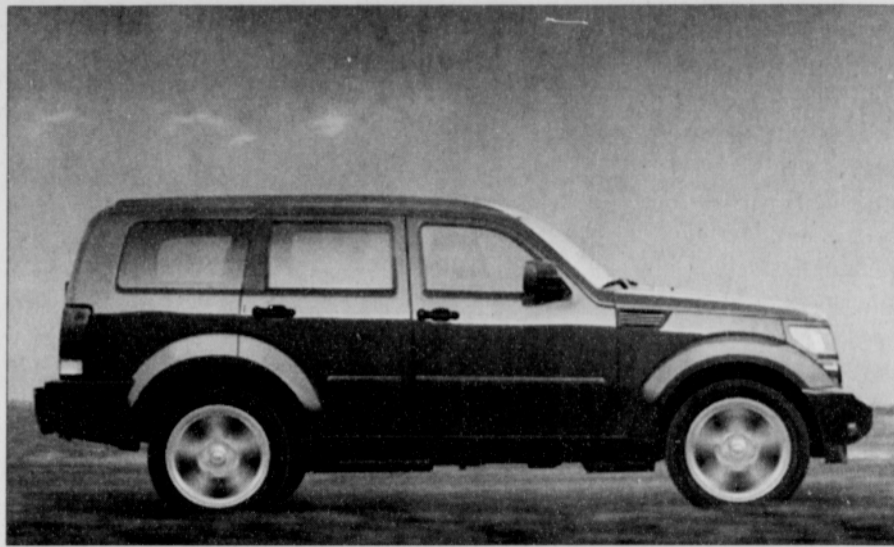
Driving is a Blast