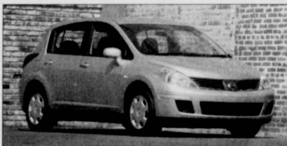
Safety and Comfort

Merging the refined style and fiery spirit of the legendary 6 Coupe with the open-air freedom of a convertible, this car seizes the imagination as boldly as it captures the eye. A muscular 4.8-liter V8 power plant delivers 360 horsepower and a riveting 5.6-second launch to 60 mph. A choice of three 6-speed transmissions and BMW's Active Roll Stabilization (ARS) ensure dynamic performance and level cornering on even the tightest curves. With the top up, the convertible roof gracefully mirrors the pleasing proportions and aggressive lines of the Coupe. With a push of the button, the top comes down for the most rewarding and exuberant drive under the stars. The 6 Series Convertible is a new perspective on pleasure.