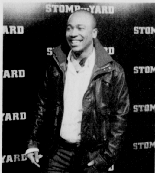
Columbus Short, a cast member in the film 'Stomp the Yard,' arrives at the premiere of the film in Los Angeles.

In a pivotal scene, the lead character, DJ Williams, who is struggling to find his place on campus, is