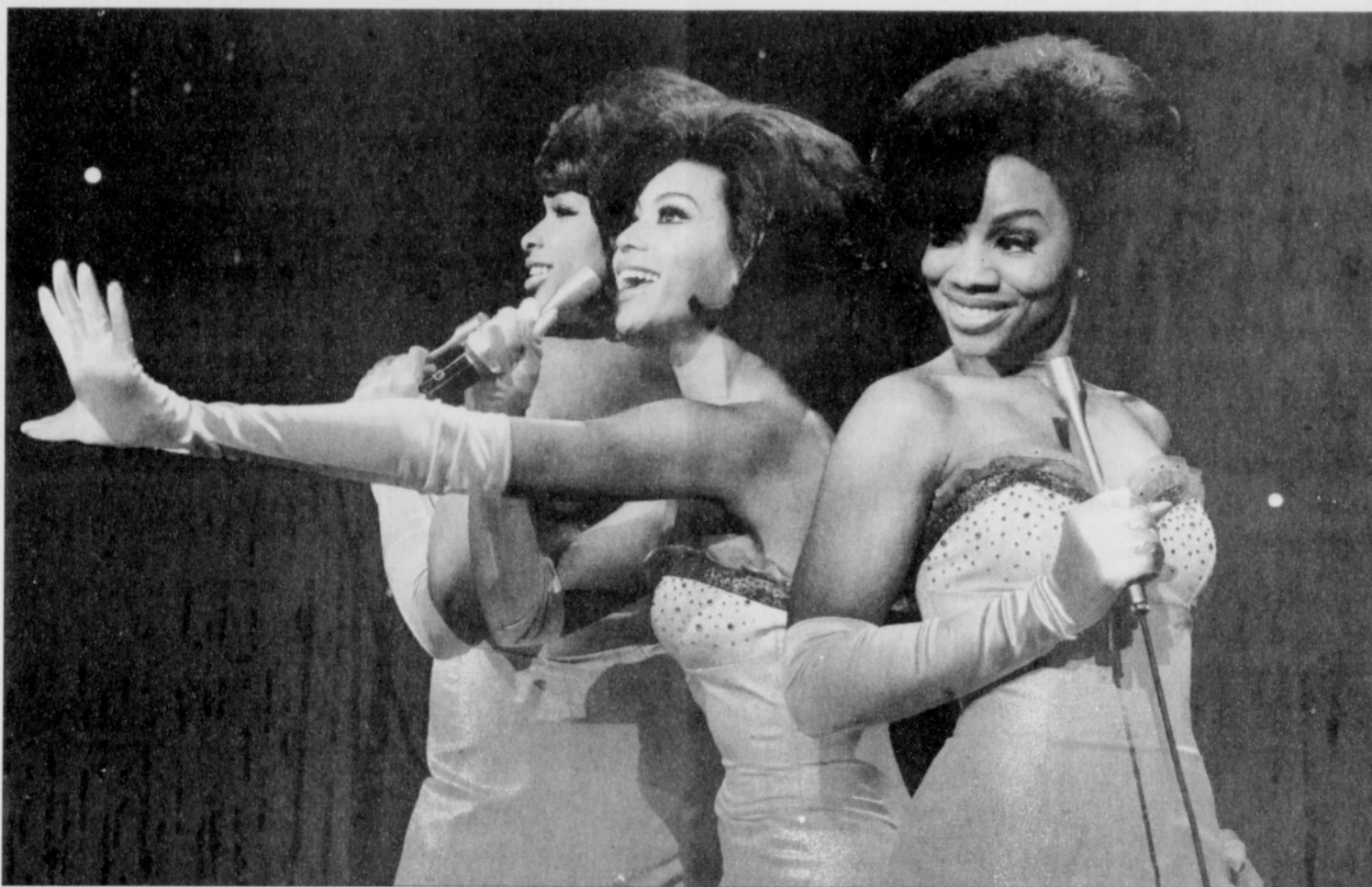
Jennifer Hudson, Beyonce Knowles and Anika Noni Rose star in 'Dreamgirls.'

The stars of "Akeelah and the Bee" — Keke Palmer, Laurence Fishburne and Angela Bassett — also earned acting nominations, as did Djimon Hounsou of "Blood Diamond" and "Pursuit of Happyness" stars Thandie New-