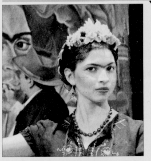
Frida at Milagro Theatre -- The artistic life of Frida Kahlo is brought to life at Milagro Theatre in a magical journey through the surrealistic vision of one of Mexico's most acclaimed artists. Performances continue Thursdays through Sundays at 8 p.m. with weekend matinees at 2 p.m. Admission is $15 to $18. Visit www.milagro.org or call 503-

Tickets are $28 for adults and $26 for students and seniors, available through the Lakewood Theatre box office at 503-635-3901 or www.lakewood-center.org.