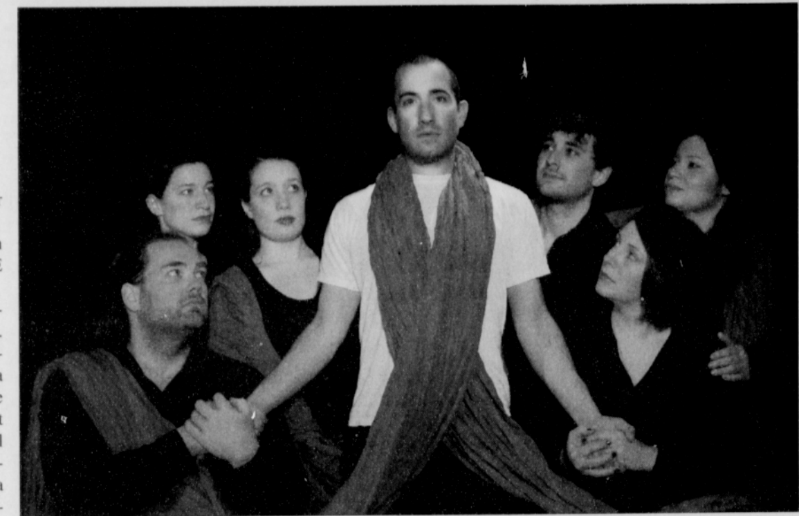
"The Yellow Boat" tells the true story of a young man's life with AIDS through Feb. 11 at Echo Theatre in southeast Portland.

www.insightouttheatre.org or call 503-493-8070. Patrons are encouraged to arrive early to catch a unique multimedia segment 20 minutes prior to the play. Dynamic Talk Backs will be held after every performance.