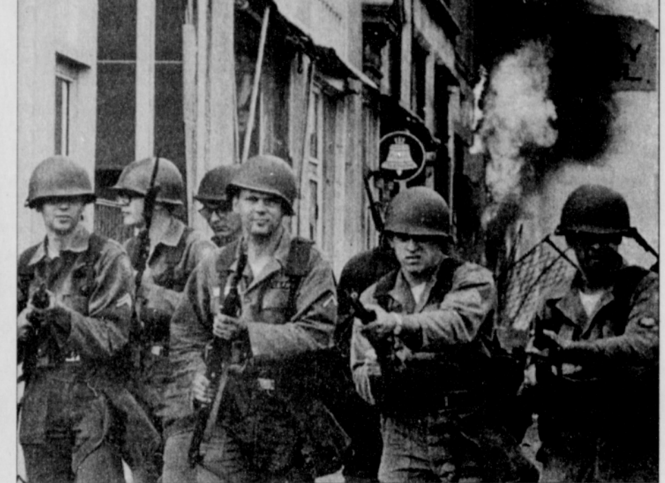
In Memphis, after violence breaks out for the first time in a march led by King, sanitation workers maintain a picket line alongside National Guard armored vehicles.

Soldiers in Detroit are deployed to suppress one of several large ghetto race riots in the summer of 1967.