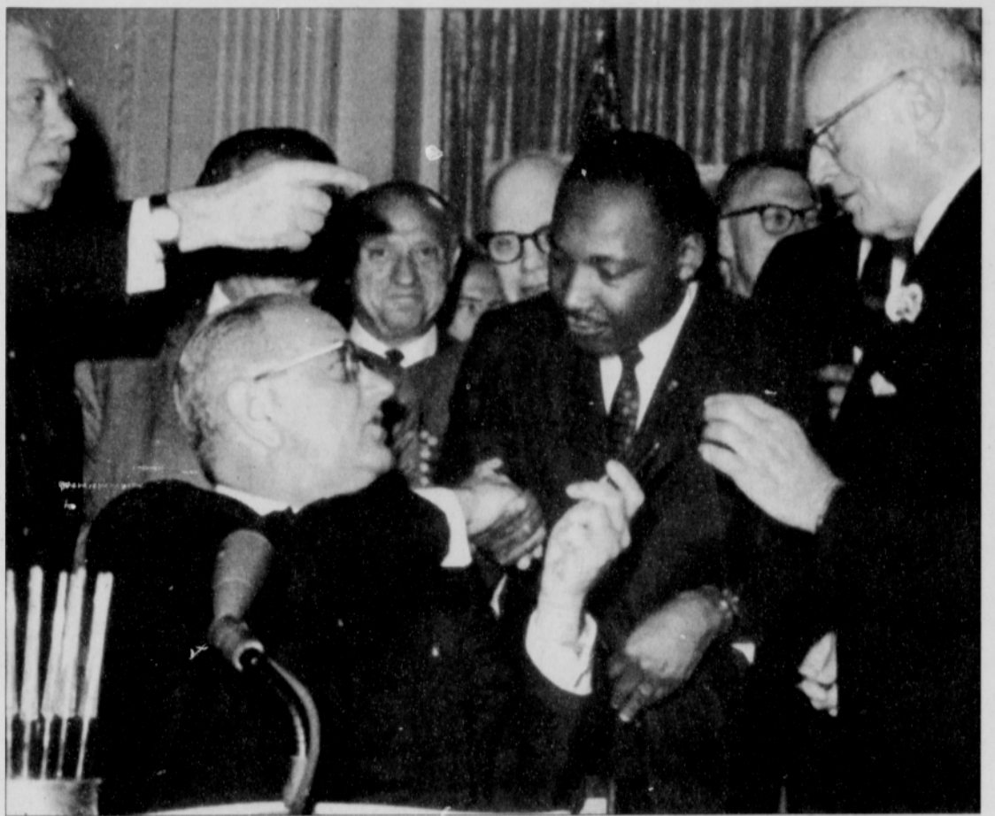
King Shakes hands with President Lyndon B. Johnson during a press conference.

"The ultimate measure of a man is not where he stands in moments of comfort, but where he stands at times of challenge and controversy."