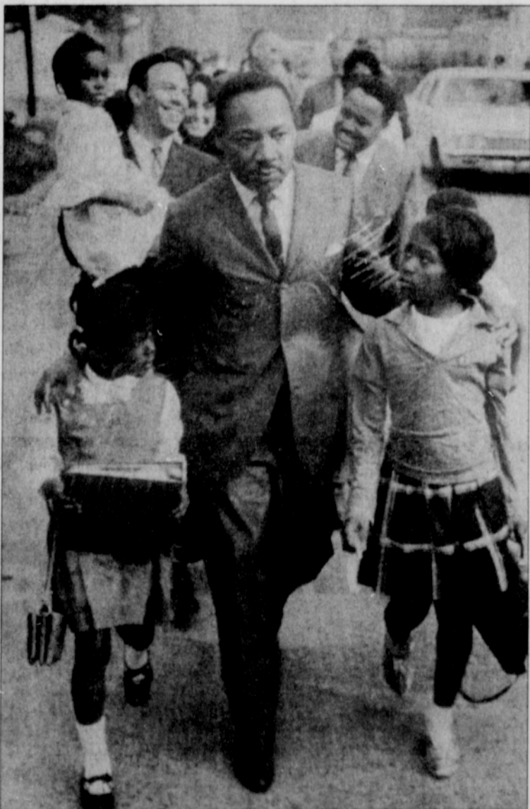
In September 1966, King escorts students with Andrew Young, Joan Baez and Hosea Williams (behind King left to right) past adult mobs that have terrorized black children outside the schools of Grenada, Mississippi.