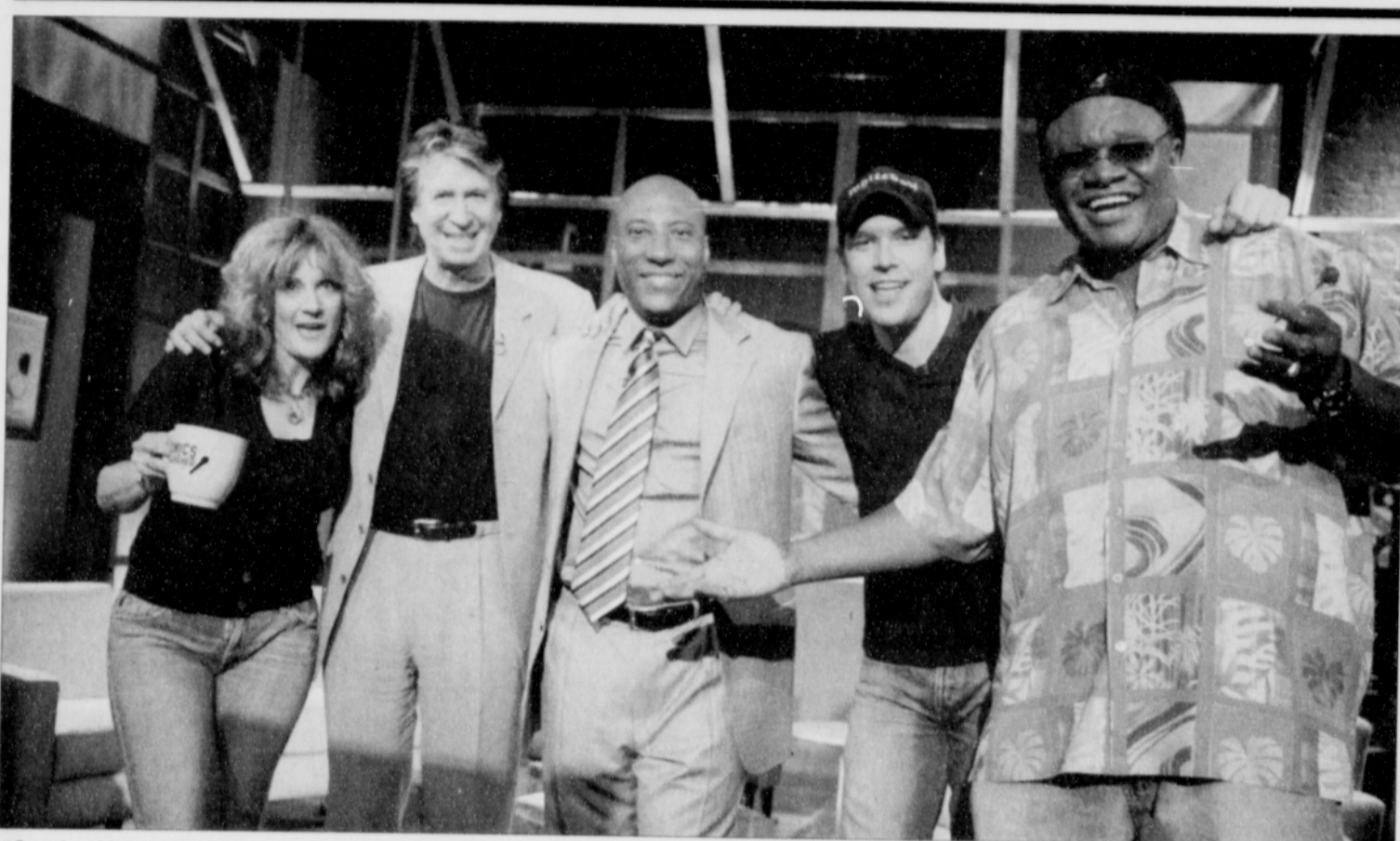
"Comics Unleashed" comes to KPDX FOX 49, bringing the backstage banter of comedians like Carol Leifer, David Brenner, host Byron Allen, Dane Cook and George Wallace.