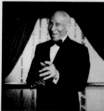
Fayard Nicholas, 91. With brother Harold, he wowed the tap dancing world. Jan. 24.