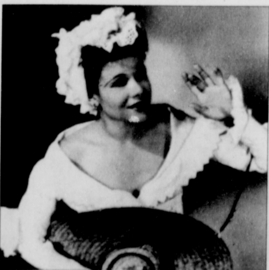
Katherine Dunham, 96. Choreographer who brought African influences to U.S. dance. May 21.