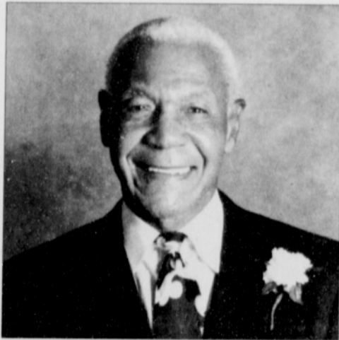
Buck O'Neil, 94. Negro Leagues batting ace; star of PBS' "Baseball." Oct. 6.