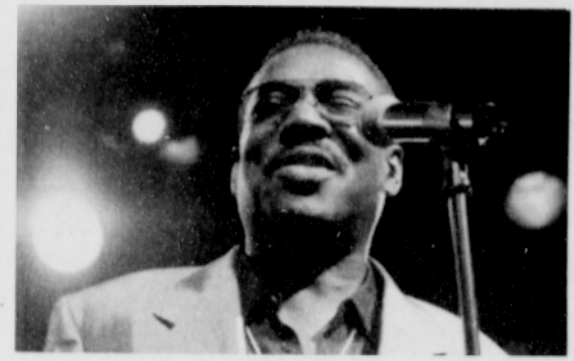
Wilson Pickett, 64. Fiery soul music pioneer ("Mustang Sally.") Jan. 19.