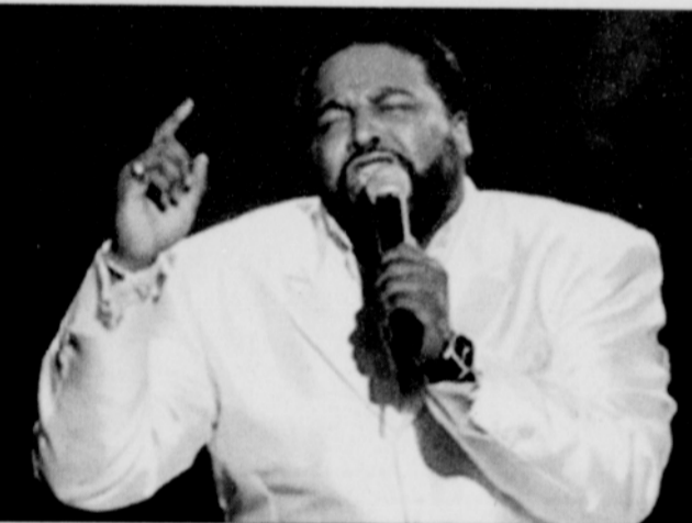
Gerald Levert, 40. Fiery R&B singer ("Casanova.") Nov. 10.