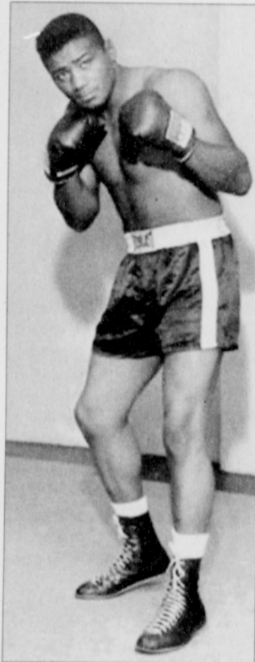
Floyd Patterson, 71. Boxing great; regained heavyweight title in 1960 in rematch. May 11.