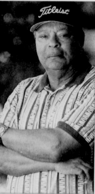
Earl Woods, 74. Father, architect and driving force behind Tiger Woods' phenomenal career. May 3. Cancer.