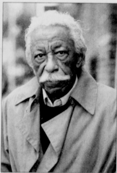
Gordon Parks, 93. Life photographer, Hollywood's first major black director ("Shaft.") March 7.

Are you currently in an adjustable rate mortgage? Is your rate increasing? Are you behind in your mortgage payments?