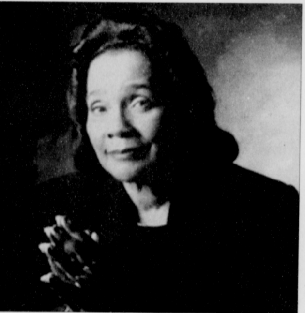
Coretta Scott King, 78. Civil rights leader; carried on work of her martyred husband. Jan. 30.