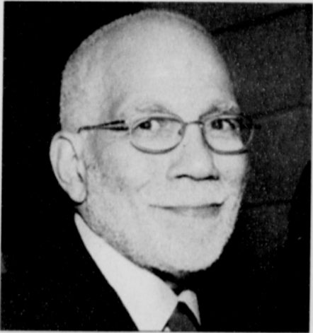
Ed Bradley, 65. TV journalist who created a powerful body of work on "60 Minutes." Nov. 9.