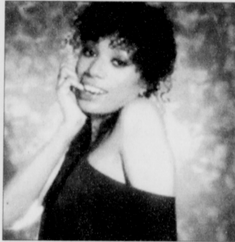
June Pointer, 52. Youngest of hit-making Pointer Sisters ("I'm So Excited.") April 11. Cancer.