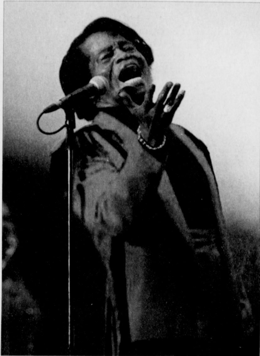
James Brown, 1933 - 2006.

emancipator, he was an originator. Rap music, all that stuff came from James Brown," entertainer Little Richard, a longtime friend of Brown's, told MSNBC.