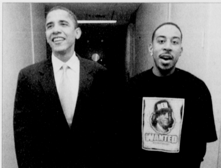
Sen. Barack Obama, D-Ill., and rapper Ludacris leave the senator's Chicago offices after a meeting to raise HIV/AIDS awareness.

The gathering at Obama's downtown Chicago office was a meeting of two star powers: Obama, who enjoys rock star-like status on the political scene, and Ludacris, who has garnered acclaim for his music and acting.