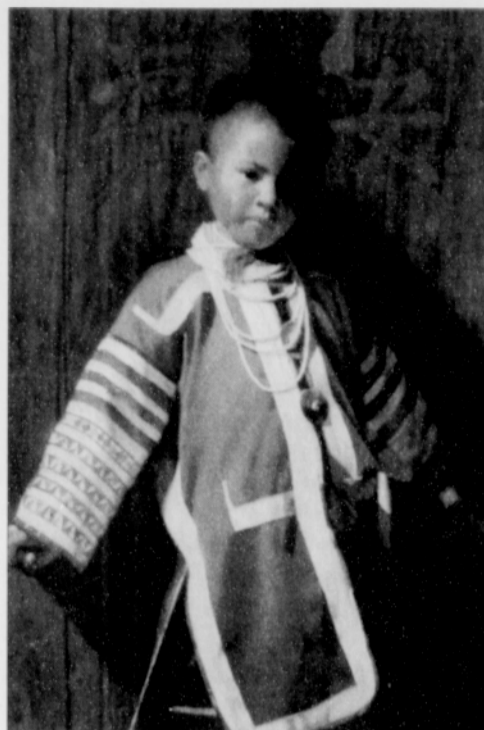
'Boy' by Li Tie