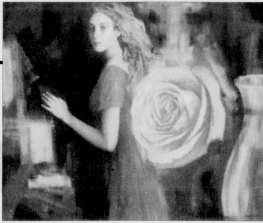
'Pink Seduction' by Zifen Qian.