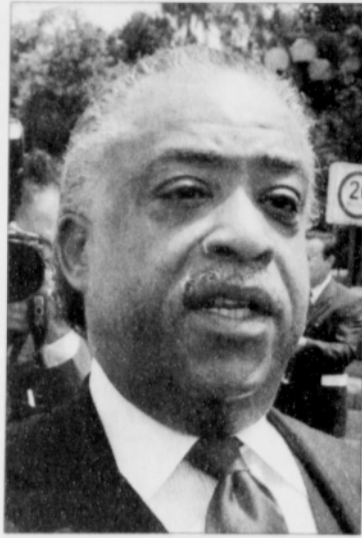
Rev. Al Sharpton