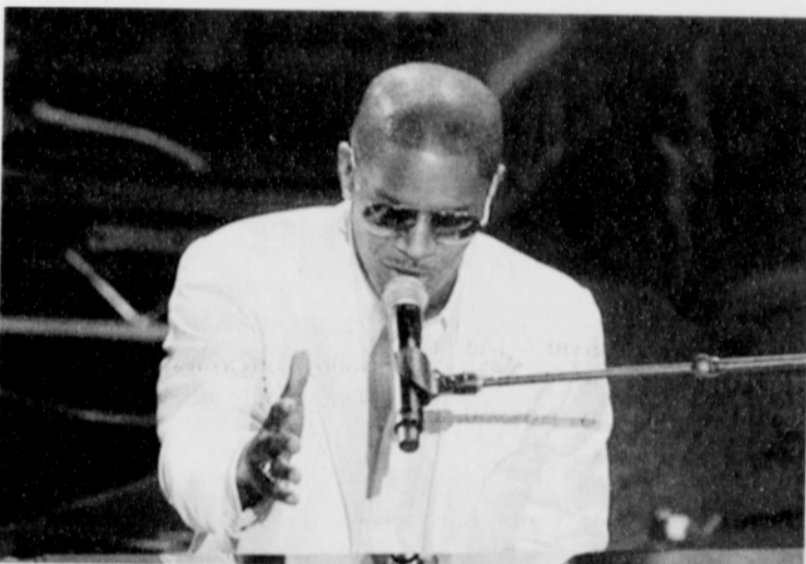
Jamie Foxx performs at the 2006 American Music Awards in Los Angeles

"My biological mother didn't raise me. A lady adopted my bio-