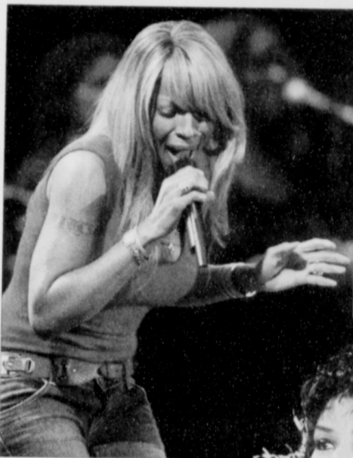
Mary J. Blige