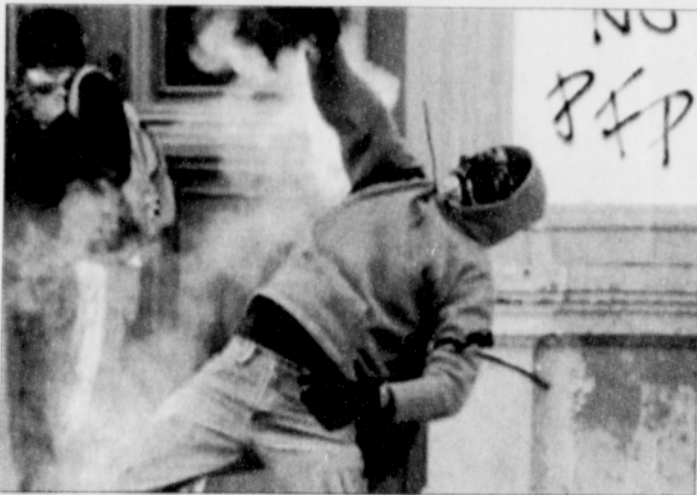
A protester throws a tear gas canister during clashes between demonstrators and federal police in Oaxaca, Mexico, on Sunday.

Youths hurled rocks, fireworks and gasoline bombs in a failed attempt to encircle federal police holding the main square, which security forces took back in late October from protesters who had held it for months demanding Gov. Ulises