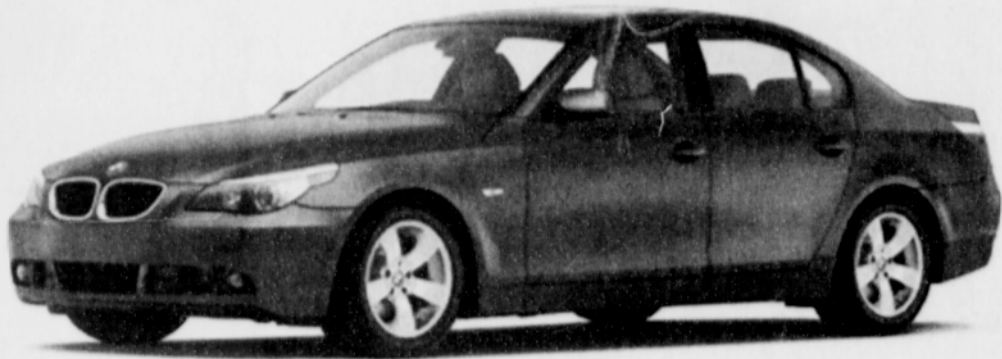
SPECIFICATIONS: 3.0-liter, 16, 215 horsepower engine; 6-speed manual-overdrive transmission; MPG is 20 in city and 29 on highway; $43,500 MSRP.