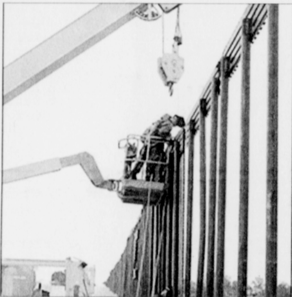
Workers build a fence along the U.S.-Mexican border.

"Speaking of borders, I must unfortunately say that in a world that greeted the fall of the Berlin Wall with joy, new walls are being built between neighborhood and neighborhood, city and city, nation and nation," said Martino, head of the Vatican's Council for Justice and Peace.