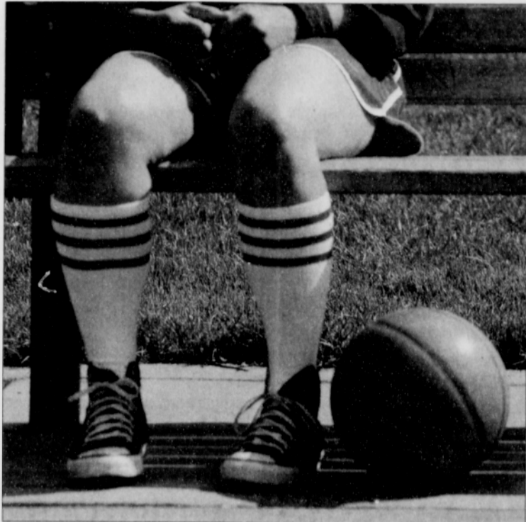
"Mutt," a play about a bi-racial young adult's mistaken Caucasian self-identity, opens Friday, Nov. 24 at north Portland's Interstate Firehouse Cultural Center.

The Interstate Firehouse Cultural Center is located at 5340 N. Interstate. Shows run subsequent Thursday-Saturday nights at 8 p.m. through Dec. 9. Tickets are $12 and can be obtained by calling 503-952-6646 or online at manyhatscollaboration.com .