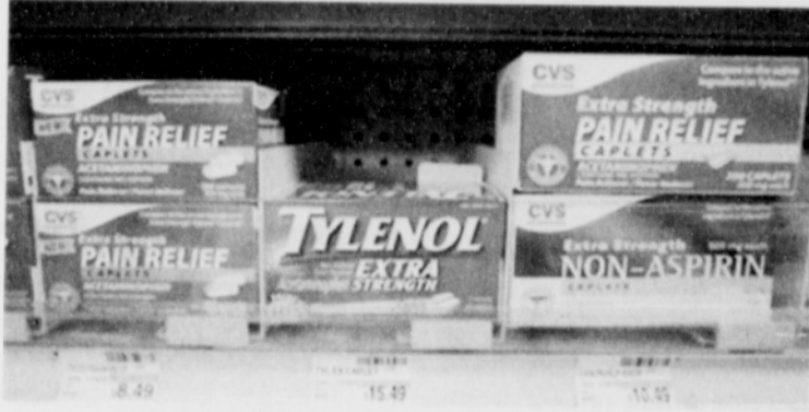
CVS and other generic brands of acetaminophen are being recalled because some of the pain-relieving pills were discovered to be contaminated with metal fragments. The recall does not affect Tylenol.

The recall affects 11 million bottles containing varying quantities of 500-milligram acetaminophen caplets made by the Perrigo Co. The pills were sold under store brands by Wal-Mart, CVS, Safeway and more than 120 other major retailers, the Food and Drug Admin-