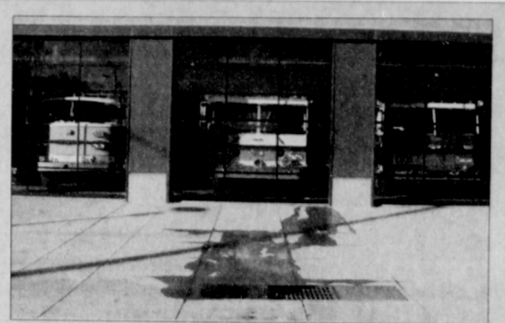
Portland Community College offers instruction in fire sciences which includes fire trucks used in training at the PCC Cascade Campus in north Portland.

Pre-registration for the program which begins at 9:30 a.m. is required. Registration can be done online at oregonstate.edu/soar .